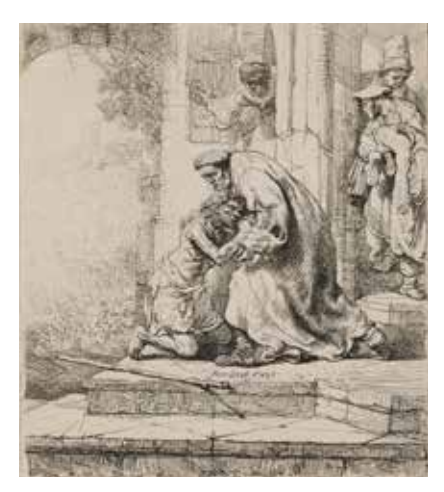
Rembrandt's 1636 etching.