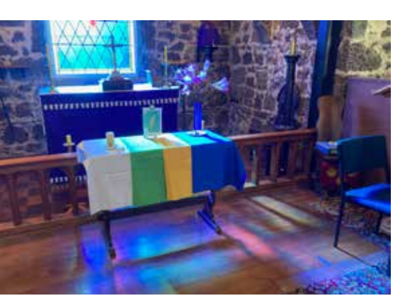
The front table decorated with coloured scarves.